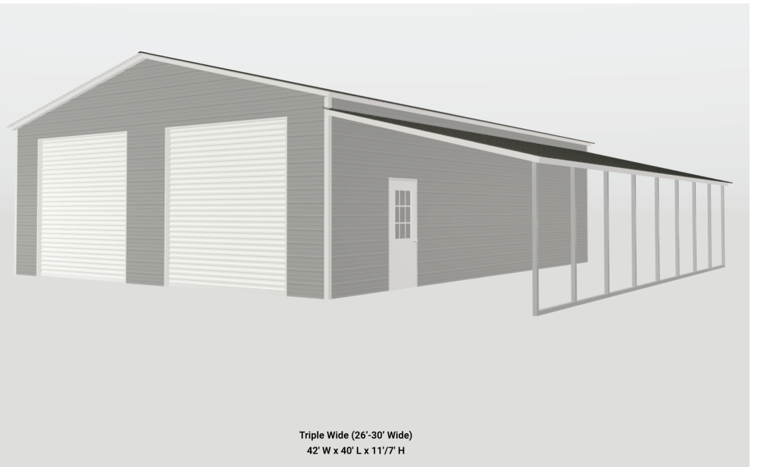
Triple Wide (26'-30' Wide) 42' W x 40' L x 11'7" H